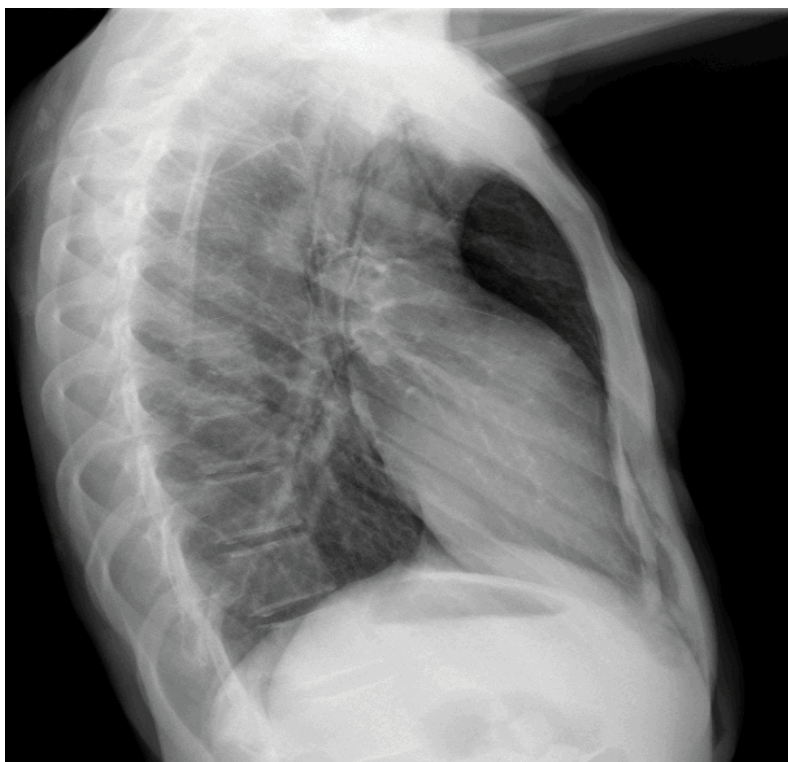
Figure 1: Chest X-ray.

Copyright: © 2018 Aguiar BBD This is an open-access article distributed under the terms of the Creative Commons Attribution License, which permits unrestricted use, distribution, and reproduction in any medium, provided the original author and source are credited.