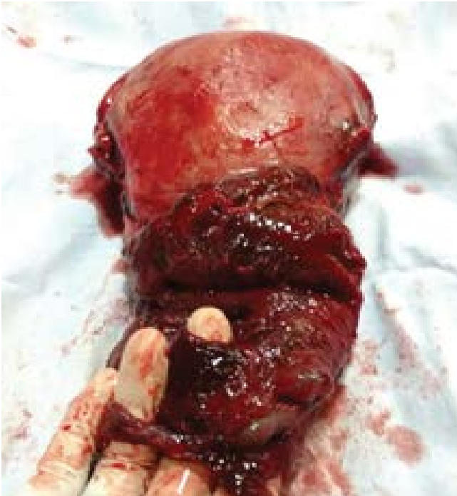
Figure 5: Anterior and posterior rupture of uterus.

hysterectomy the coming week but in view of severe bleeding she underwent emergency hysterectomy (Figure 6).