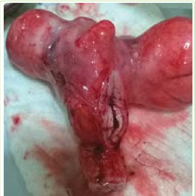
Figure 6: Uterus with multiple fibroids.

Uterine atony was the commonest indication for EPH in past followed by uterine rupture. Our study too indicated uterine atony as the commonest indication for EPH as reported by many other studies [1,3-5]. Postpartum