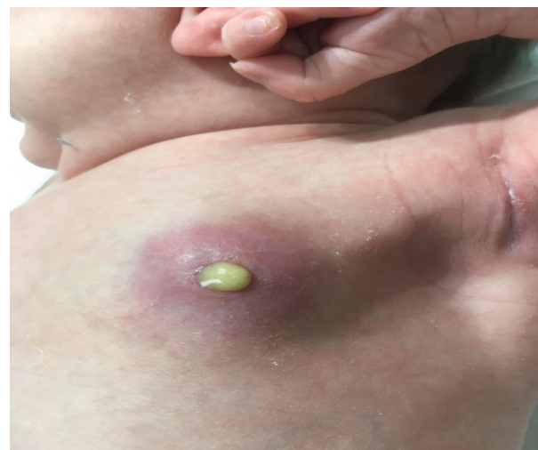
Figure 1: Appearance of the patient before treatment.

The pathogenesis of mastitis is not fully known. However, infection is thought to develop mostly from skin flora entering the nipple with retrograde spread via the ductal