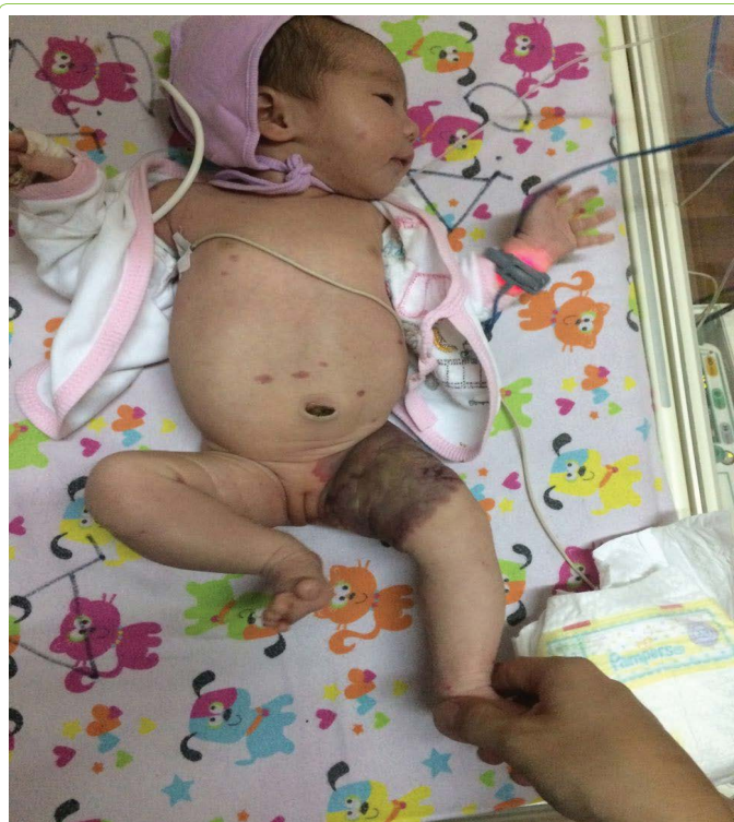
Figure 1: The arrows mark a large hemangioma in the left thigh and small hemangiomas across the body.