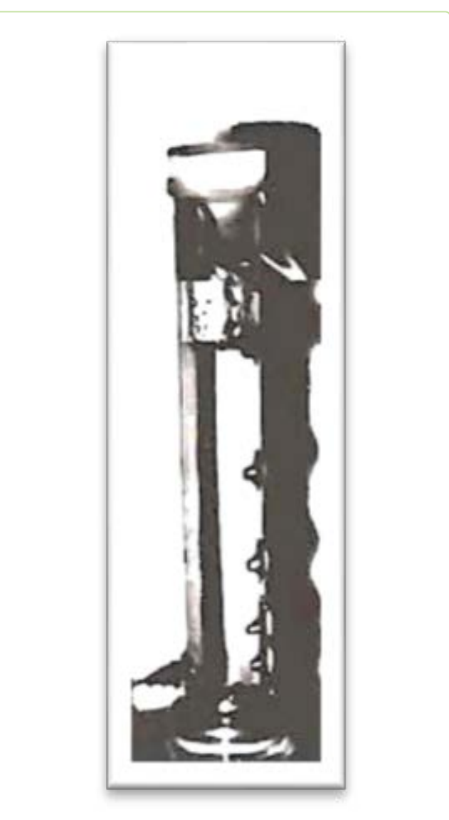
Figure 1: The common form of laboratory electroflotator.

Structurally developed electroflotator of continuous action for the industrial waste water purification has floatation camera - 7, fulfilled in the form of the rectangular capacity, whose angles are supplied by the special inserts, in consequence of which, the internal part of the camera