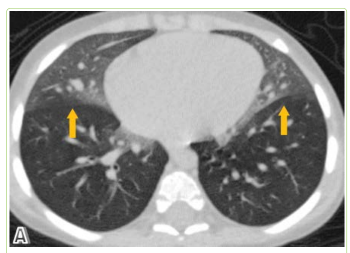
Figure 1: High resolution tomographic images with a pulmonary window in axial.

NEHI was first described in 2005, presenting with symptoms of ILD in the first year of life, such as persistent