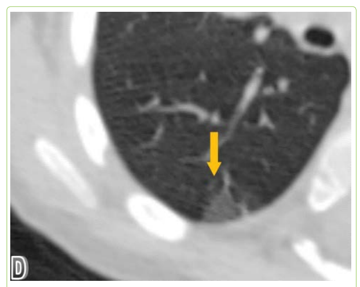
Figure 4: An enlarged axial plane image in the pulmonary window showing a subpleural area of ground-glass opacification.

tachypnea, retractions, hypoxemia, and crackles. Previously the term persistent tachypnea of infancy had been used to describe this clinical presentation. The only consistent histopathological abnormality was an increase in clear cells in distal airways, consistent with pulmonary neuroendocrine cells (PNEC), confirmed by immunohistochemistry with antibody to bombesin [7,8]. PNEC can also be visualized with antibodies to other neuropeptides such as Chromogranin A, synaptophysin, and CD56 [9].