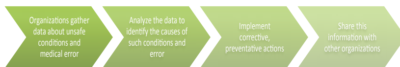
Figure 3: A step-wise benefits of medical error data sharing system.

systems within Korean medicine is strongly suggested. In South Korea, medical errors are rarely shared across hospital partly because of the nature of the adverse events. In so being, hospitals are missing a critical opportunity to learn from these devastating incidents. Failure to identify errors leads to reoccurrence of mistakes and deteriorating patient safety in healthcare organizations. Therefore, an efficacious medical error reporting system is a necessity. A nation error reporting system needs to be established in the future to effectively design medical error prevention and management systems at the national level. One way to establish an effective reporting system is the use of information systems.